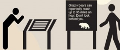
Two information waysides