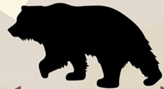
One Grizzly bear

Looking for the best place for #socialdistancing? Many park areas remain accessible to provide that distance, but please do it safely and responsibly!