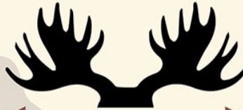
A moose's antlers