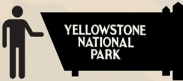
A national park sign